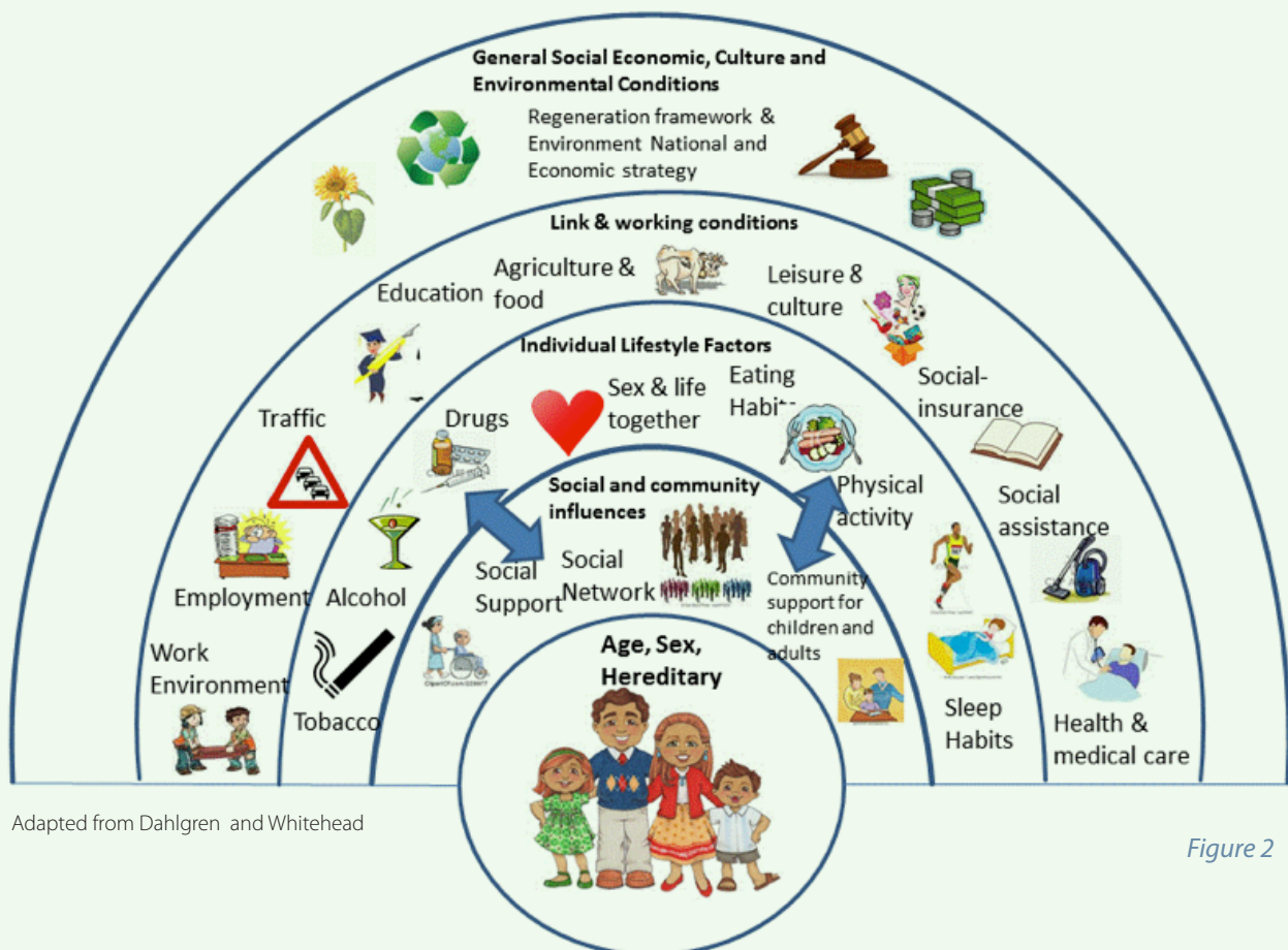
Adapted from Dahlgren and Whitehead

Figure 2 illustrates how we see the health and care system working in collaboration to support local communities. It is acknowledged that for a robust delivery of the strategy wider factors affecting short and long term physical and mental health need to be considered, such as access to green space, climate change resilience, air quality, housing, transport, inequality and employment . To address this, Kent partners have developed a Sustainability Needs Assessment as part of the Joint Strategic Needs Assessment (JSNA). The recommendations identified, in combination with ongoing delivery of the Kent Environment Strategy, underpin our approach to ensuring a sustainable health and care system Through a joined-up, or integrated, approach Kent County Council will make sure that the people of Kent have access to a good standard of education, a clean, safe and sustainable environment in which to live, with good employment opportunities, and will work with local businesses to ensure good workplace health.